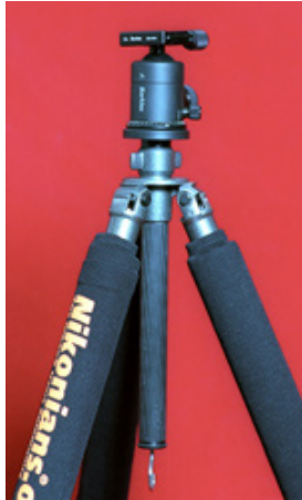
Gitzo with Markins Q-Ball