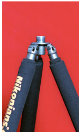
4. Remove column liner