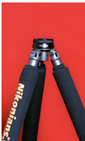
6. Fasten TB plate