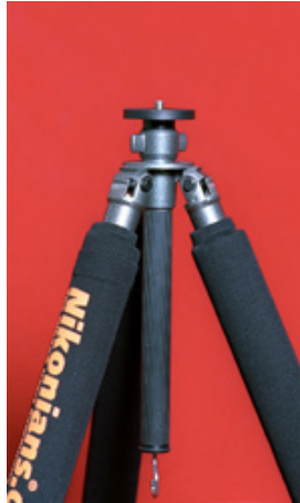
1. Remove ballhead