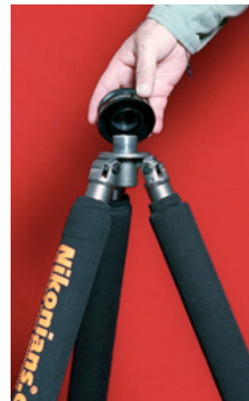
5. Screw in TB plate