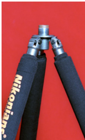
3. Remove column fastener