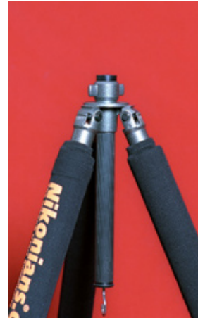
2. Remove platform & bolt