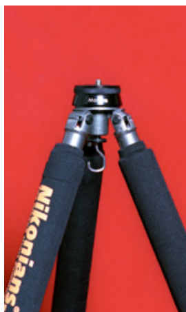
7. Insert TB tube, attach hook